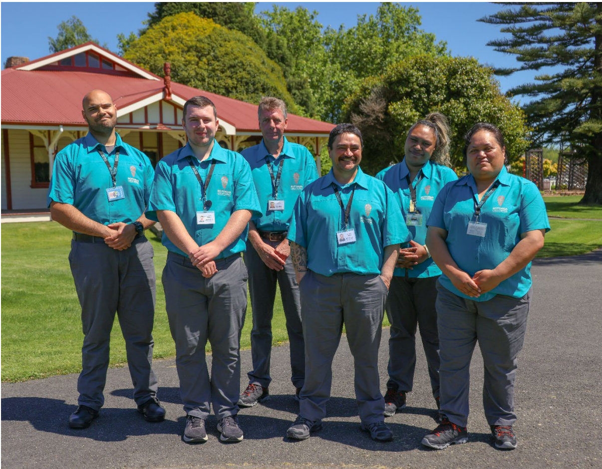
Some of the Safe City Guardians you'll see patrolling the CBD.